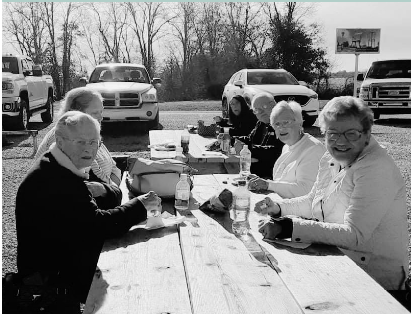
Douglas County seniors loved the Family Service field trip to the Moonshine Store in Martinsville, IL